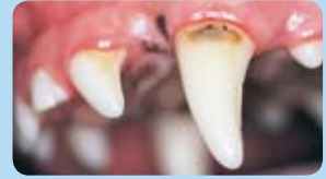
(b) Gingivitis – with early calculus